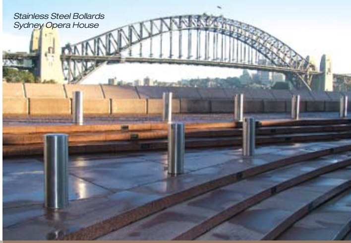
Stainless Steel Bollards Sydney Opera House